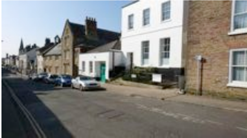
Disabled car parking space on road by the Museum.