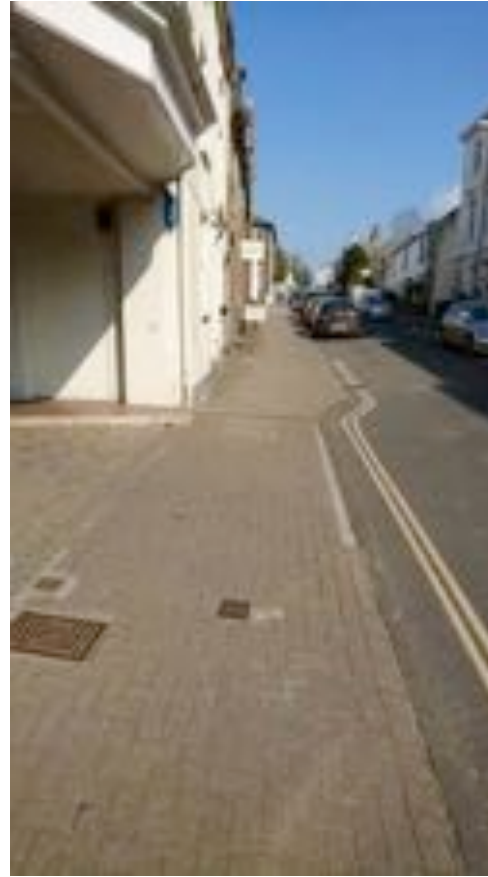
The Museum is 325ft away from the car park.