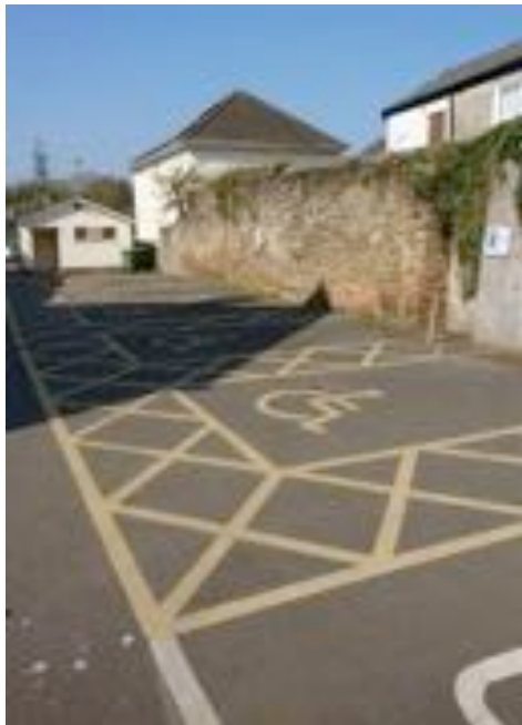
6 Disabled spaces at the Fore Street car park.