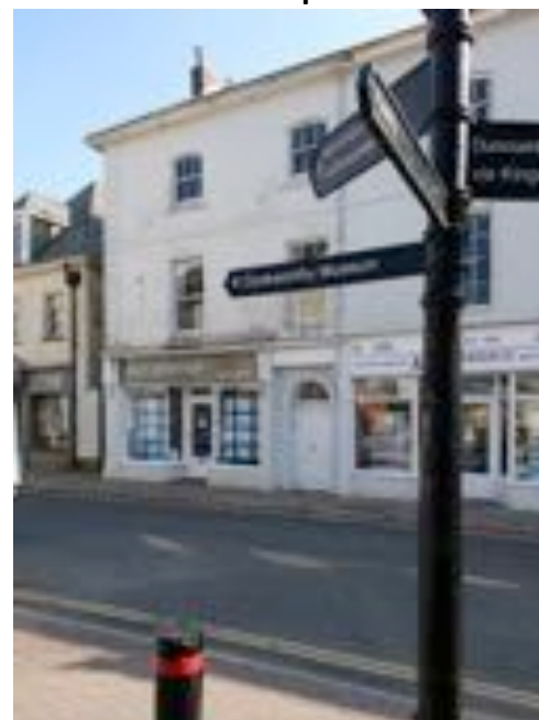
Turn left and head up Fore Street.