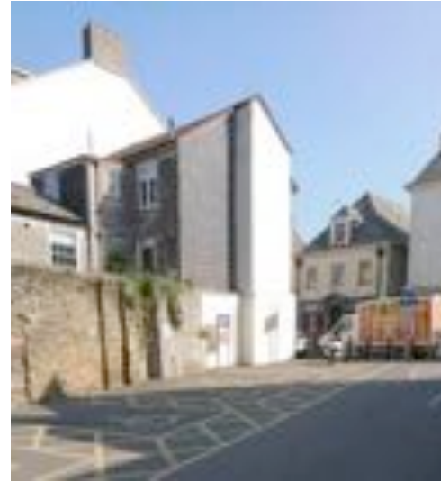
From the car park - walk towards Fore Street.