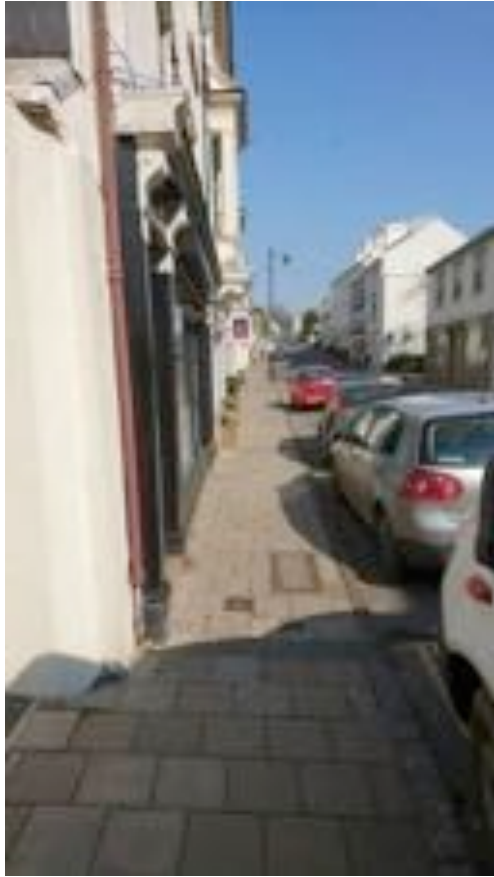
The view up Fore Street. The Museum is on the left.